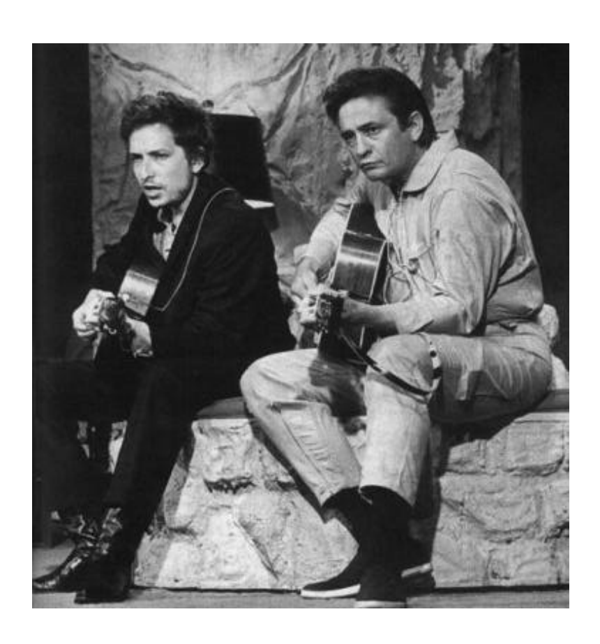
© 2001 by Olof Björner All Rights Reserved.

This text may be reproduced, re-transmitted, redistributed and otherwise propagated at will, provided that this notice remains intact and in place.