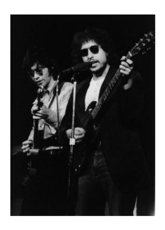
© 2001 by Olof Björner All Rights Reserved.

A SUMMARY OF RECORDING & CONCERT ACTIVITIES, RELEASES, TAPES & BOOKS.