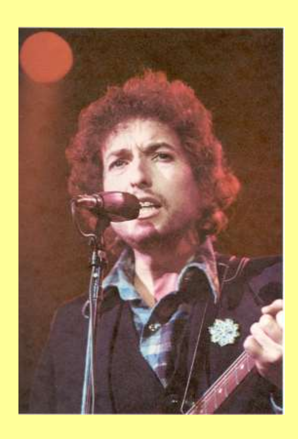
© 2001 by Olof Björner All Rights Reserved.

This text may be reproduced, re-transmitted, redistributed and otherwise propagated at will, provided that this notice remains intact and in place.