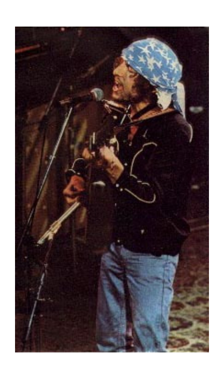
© 2002 by Olof Björner All Rights Reserved.

This text may be reproduced, re-transmitted, redistributed and otherwise propagated at will, provided that this notice remains intact and in place.