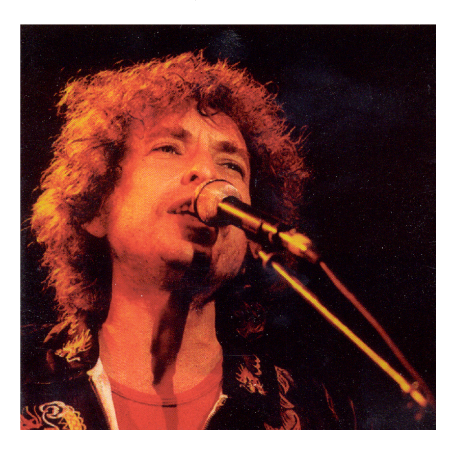
© 2004 by Olof Björner All Rights Reserved.

This text may be reproduced, re-transmitted, redistributed and otherwise propagated at will, provided that this notice remains intact and in place.