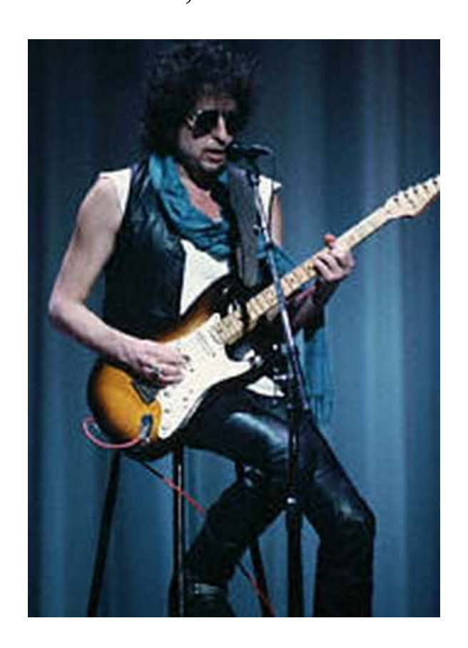
© 2004 by Olof Björner All Rights Reserved.

This text may be reproduced, re-transmitted, redistributed and otherwise propagated at will, provided that this notice remains intact and in place.