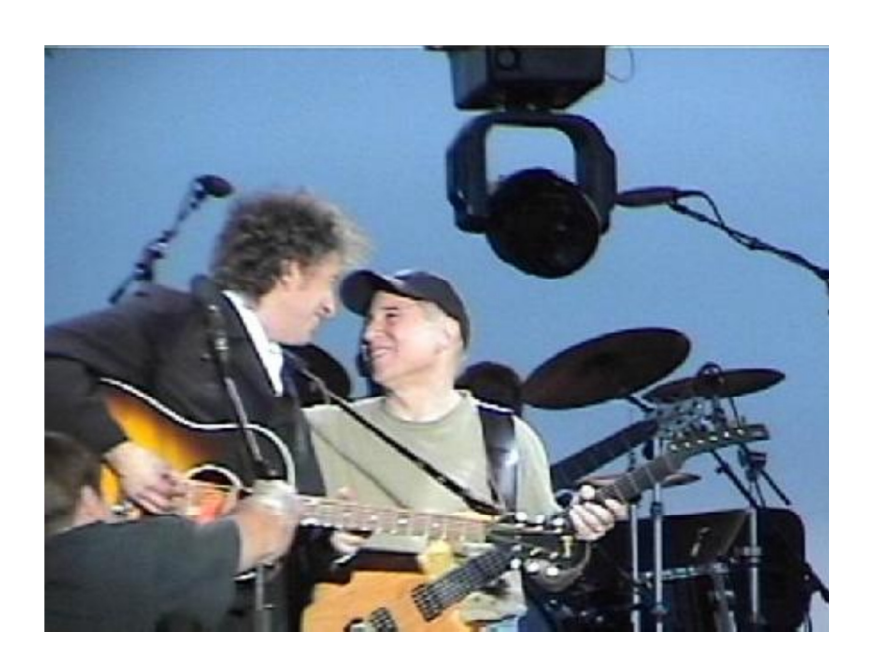
© 2000 by Olof Björner All Rights Reserved.

This text may be reproduced, re-transmitted, redistributed and otherwise propagated at will, provided that this notice remains intact and in place.