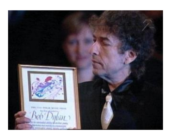
© 2001 by Olof Björner All Rights Reserved.

This text may be reproduced, re-transmitted, redistributed and otherwise propagated at will, provided that this notice remains intact and in place.