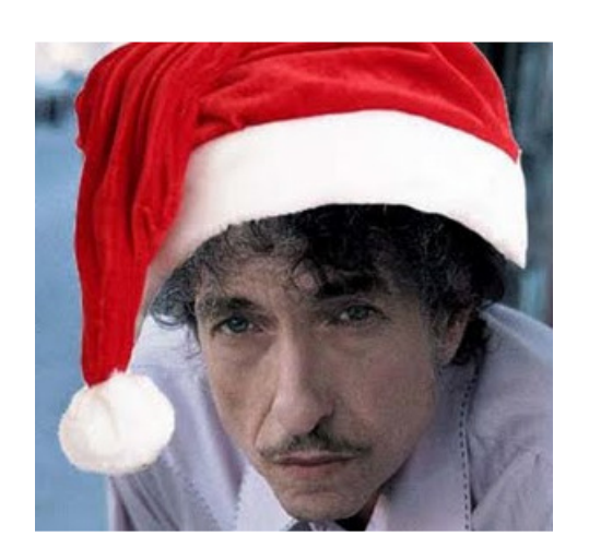
© 2011 by Olof Björner All Rights Reserved.

This text may be reproduced, re-transmitted, redistributed and otherwise propagated at will, provided that this notice remains intact and in place.