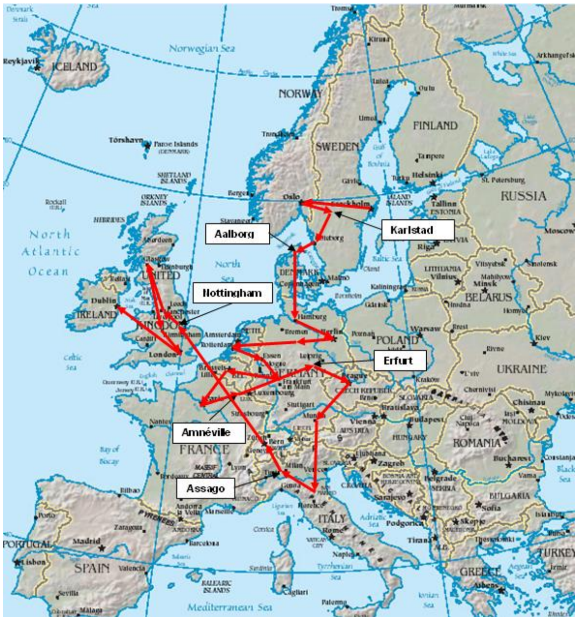
Bob Dylan: Still On The Road – 2005 Europe Fall Tour