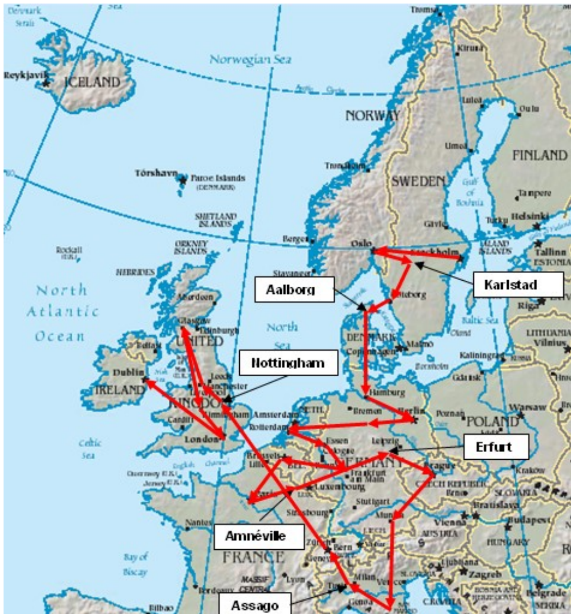
Bob Dylan: Still On The Road – 2005 Europe Fall Tour