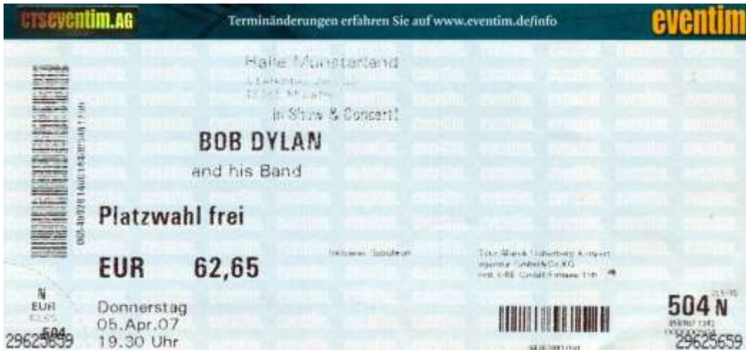
Session info updated 8 August 2020.