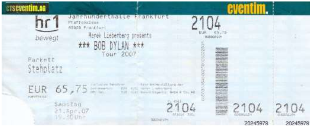
By courtesy of Michele Ulisse Lipparini. Session info updated 17 August 2020.