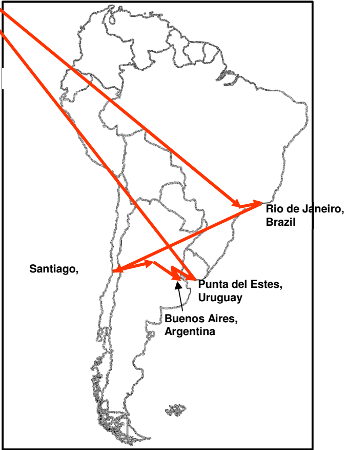
Bob Dylan: Still On The Road – 2008 South of the South Tour