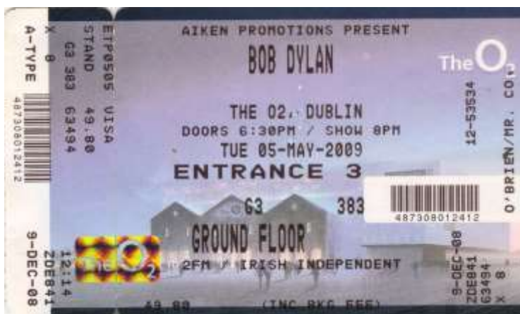
Session info updated 27 July 2020.

8 new songs (47%) compared to previous concert. 1 new song for this tour. Stereo audience recording, 115 minutes.