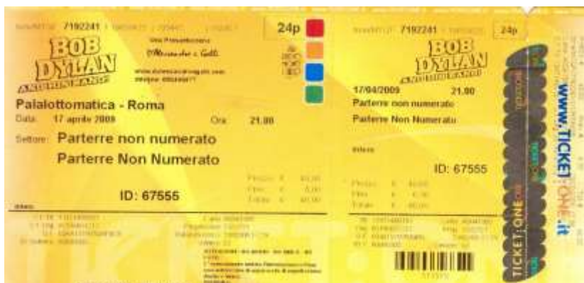
By courtesy of Michele Ulisse Lipparini. Session info updated 27 July 2020.

12 new songs (66%) compared to previous concert. 1 new song for this tour. Stereo audience recording, 115 minutes.