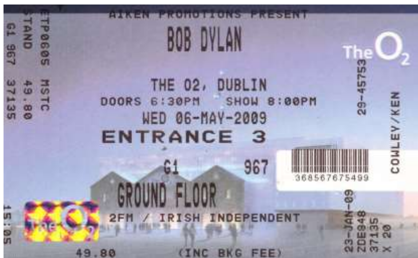
Session info updated 27 July 2020.

11 new songs (61%) compared to previous concert. No new songs for this tour Stereo audience recording, 120 minutes.