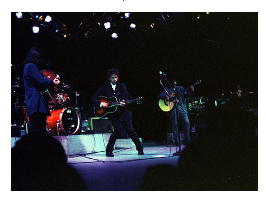
© 1999 by Olof Bjorner All Rights Reserved.

This text may be reproduced, re-transmitted, redistributed and otherwise propagated at will, provided that this notice remains intact and in place.