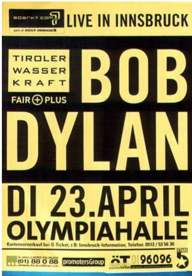
Session info updated 23 January 2021.