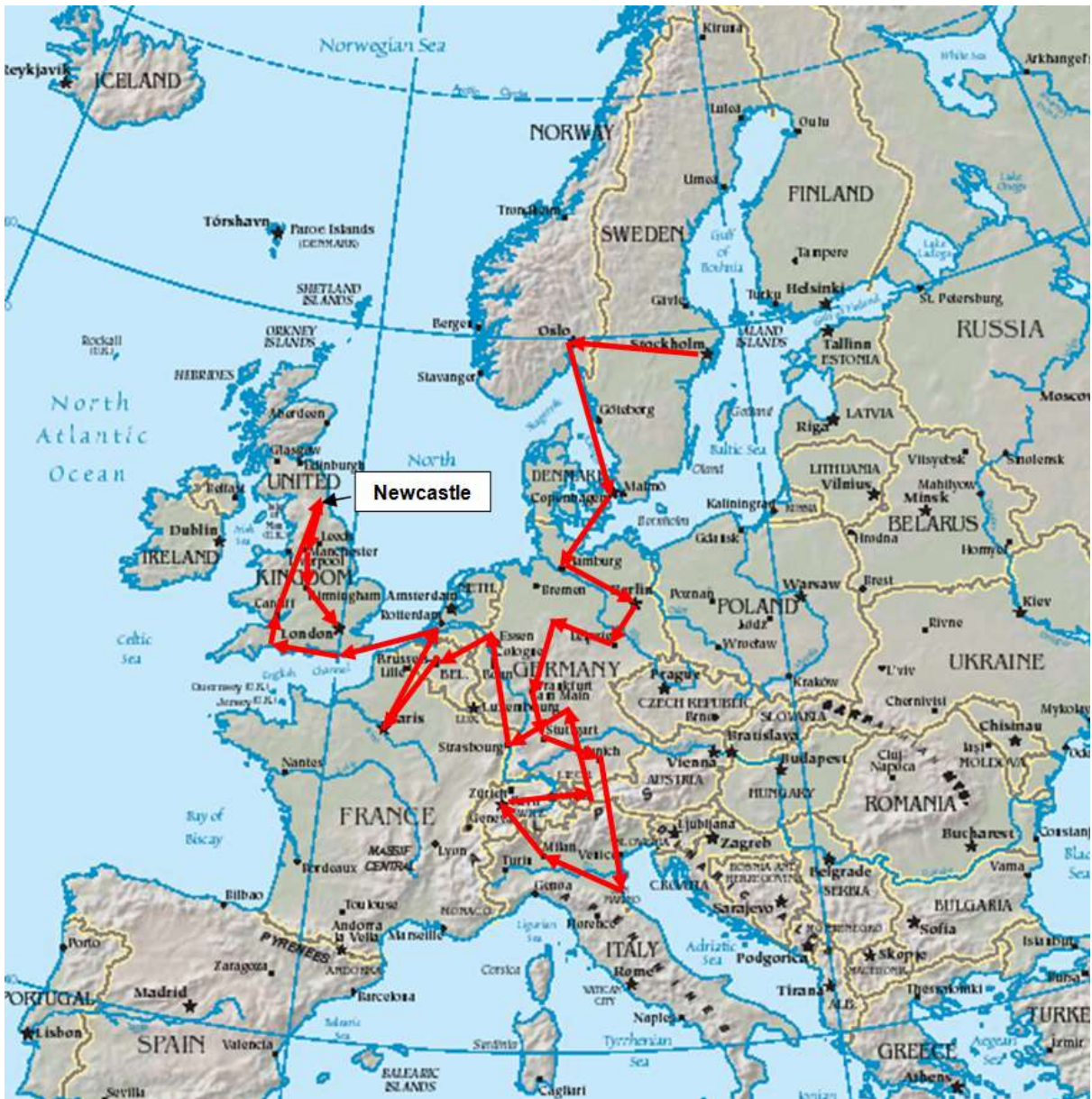
Bob Dylan: Still On The Road – 2002 Europe Spring Tour