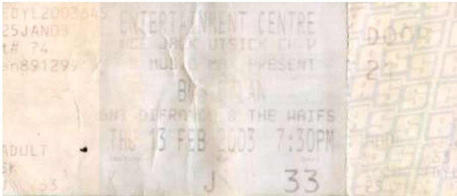
By courtesy of Michele Ulisse Lipparini. Session info updated 23 December 2020.