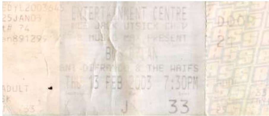
Session info updated 23 December 2020.