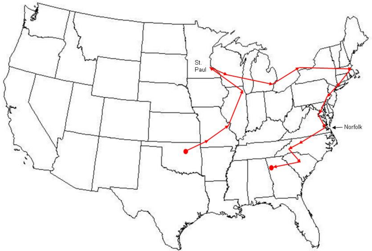
Bob Dylan: Still On The Road – 2004 US Spring Tour