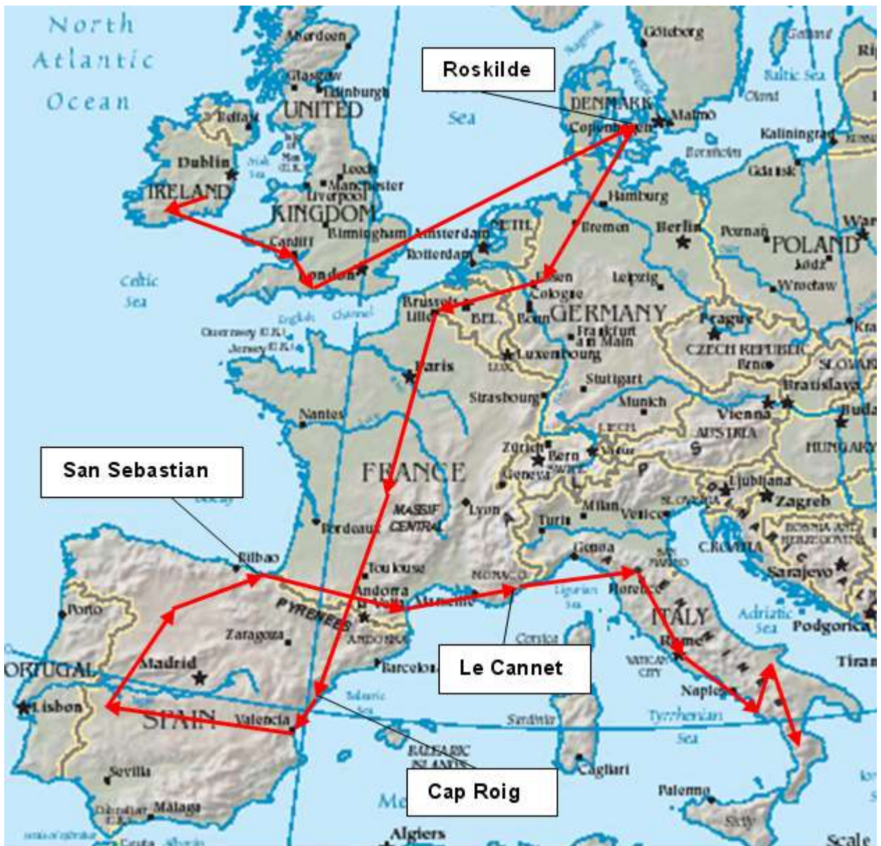
Bob Dylan: Still On The Road – 2006 Europe Summer Tour